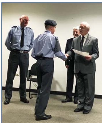
Presentation of Wings Certificates.