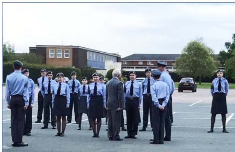
Our Branch Chairman inspecting 2342 ATC Squadron cadets.